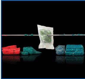
Control —RESOLV to have more effective performance.*

Liphatech, The Soft Bait Innovators™ and makers of FirstStrike®, bring you a wax-free bait that is superior to traditional blocks.