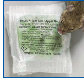
Performance —RESOLV to get better results.