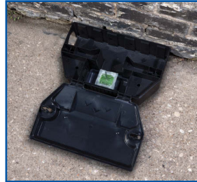
Simplify —RESOLV to use it anywhere.