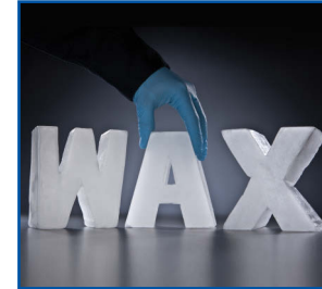
Economical —RESOLV to avoid 1.7 kg of wasteful wax filler.**